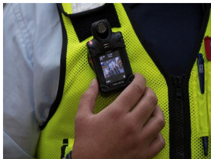
Image 2. Small wearable camera

Many consumer products have practical applications in small and large businesses. Ensuring these products will operate safely in workplaces begins with using batteries, chargers, and associated equipment that are tested in accordance with an appropriate test standard (e.g., UL 2054) and, where applicable, certified by a Nationally Recognized Testing Laboratory (NRTL) . 1 Manufacturer's instructions provide procedures for use, charging, and maintenance that is specific to each device and necessary to prevent damage to the lithium batteries (See Image 1). For example, some batteries will overcharge if a charger is used that does not turn off when the battery is fully charged.